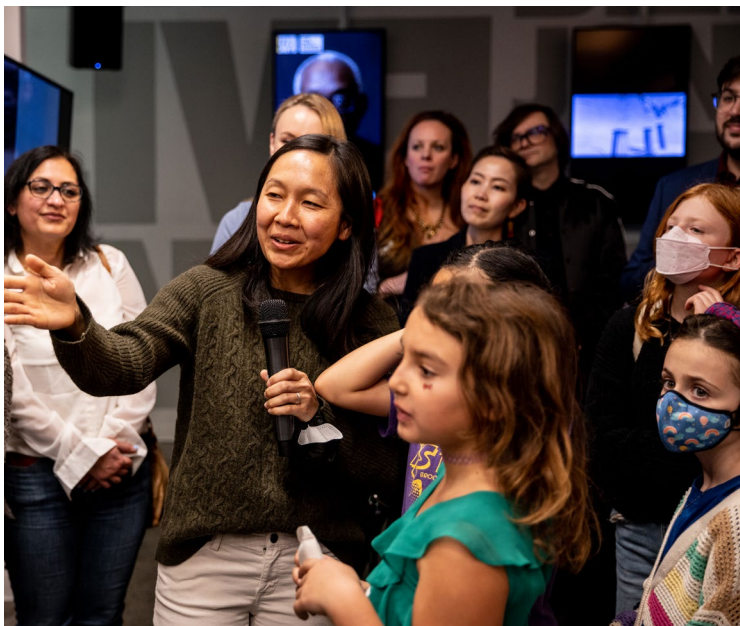
Image: "In/Between 2023: Lush Friction,"

During the past fiscal year, NYFA Learning has directly served 2,785 artists and cultural workers —through both in-person and online professional development programs and workshops. An additional 650+ were provided with access to workshop materials and 9,300+ subscribed to our newsletter. NYFA Learning's core goals are to build and foster creative communities through education, offered locally, nationwide, and internationally. We offer tools and resources that artists and cultural workers can apply to their career and/or artistic practice.